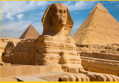
PYRAMIDS of GIZA